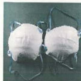
Photo mask Cleanair-3.JPG