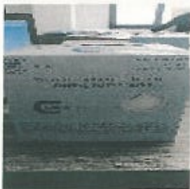
Photo packaging mask Cleanair-1.jpg Main picture